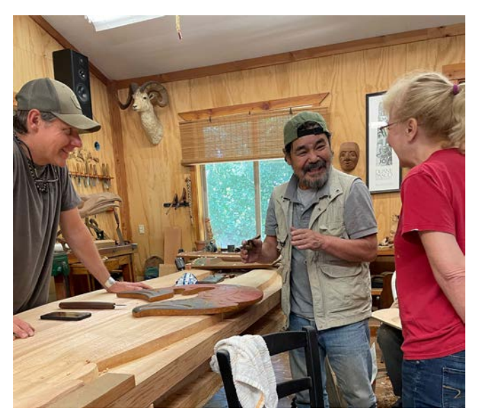
There was plenty of friendly conversation.