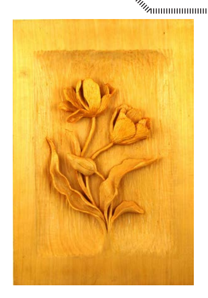
"Tulips" by Mack Sutter From the OCG Collection

Call for Pictures of Your Carvings One of the highlights of face-to-face meetings is doing a "show and tell" about carvings we have done. Each month we will include a brief narrative with pictures of members' work. When you send photos of your work to OCG Newsletter Editor, please let us know some details, such as: » Wood used » Size, including thickness of stock » Finish, including coloration, if any » Special techniques or considerations, if any » Any other information of interest A few tips on taking photos: » Position your camera (or phone) parallel to your work » Use natural light (sunlight) if possible » The only shadows you see should be in the work (not you) » Use a high contrast background so your work stands out