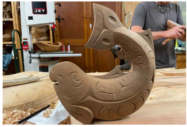
What a well executed complete salmon carving could look like. Students had the option to choose a different pattern and also had the option to paint it before the incised pattern is carved.