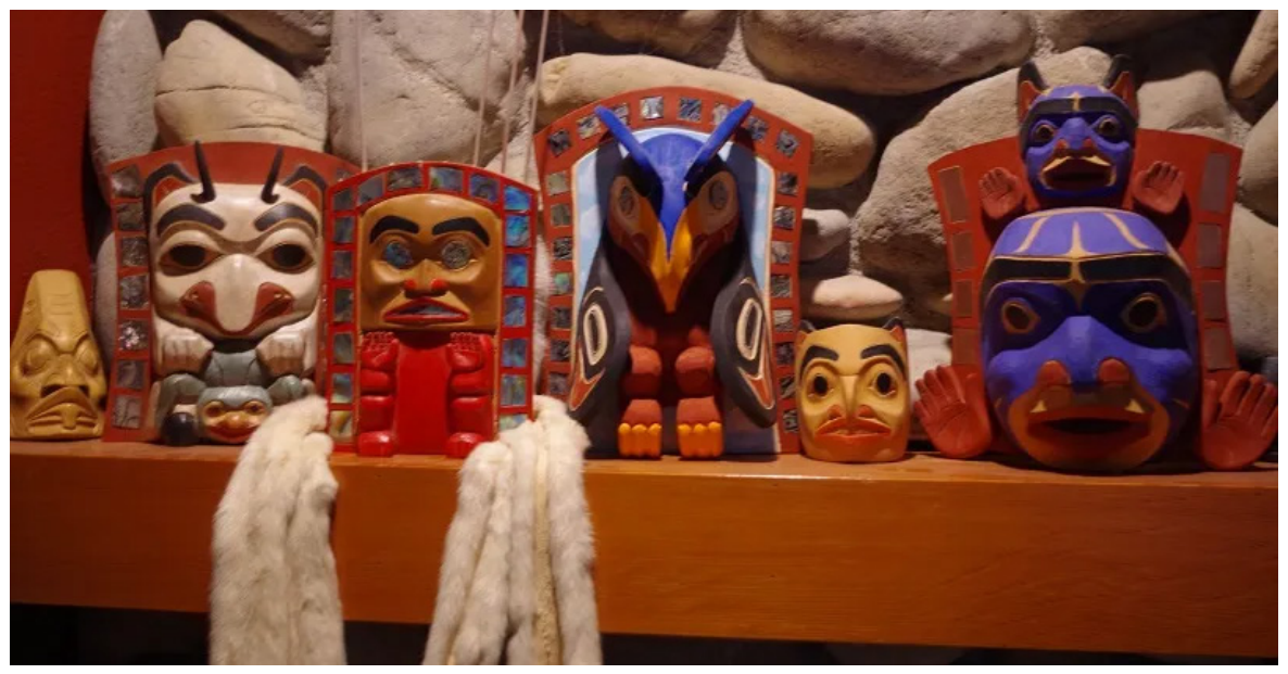
Masks Carved by Dick Wilk

Among the many workshops the Sitka Center offers, there are 2 woodcarving classes and a pyrography class. You can check out the classes at the <u>Sitka Center website</u>.